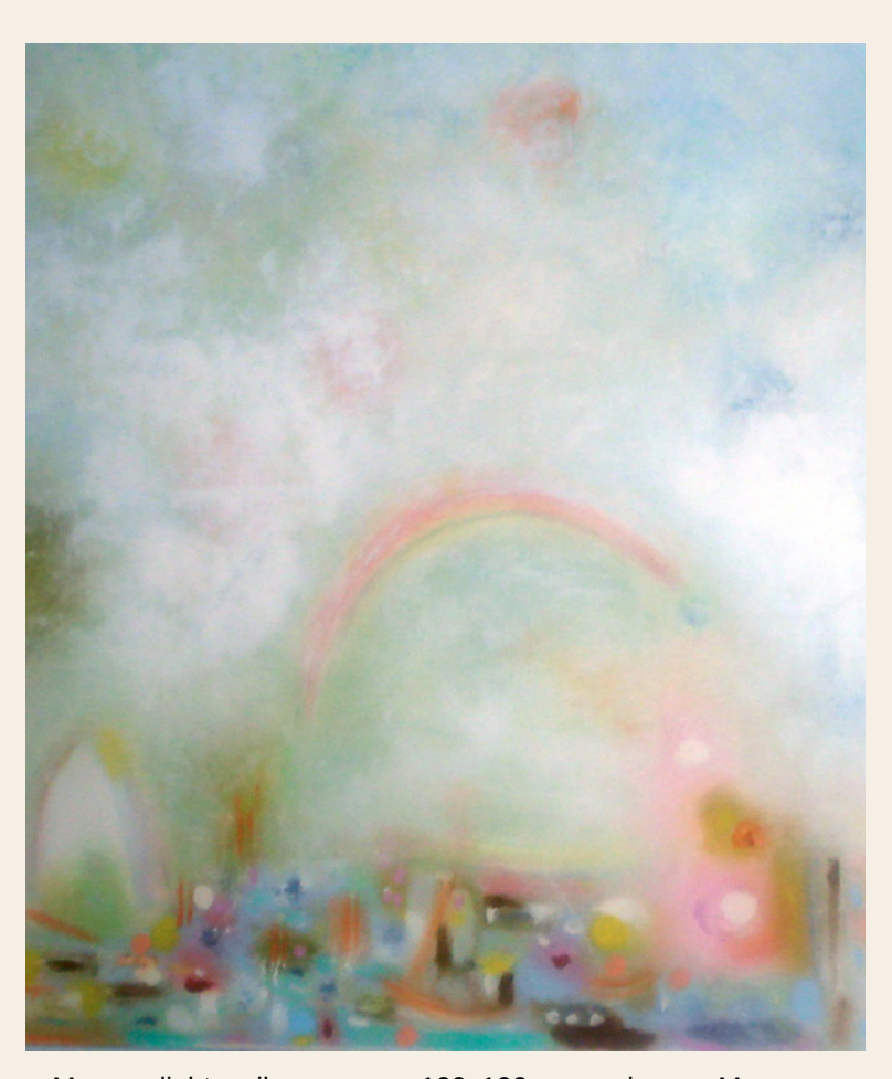
Monaco lights, oil on canvas, 100x100cm provinance Monaco